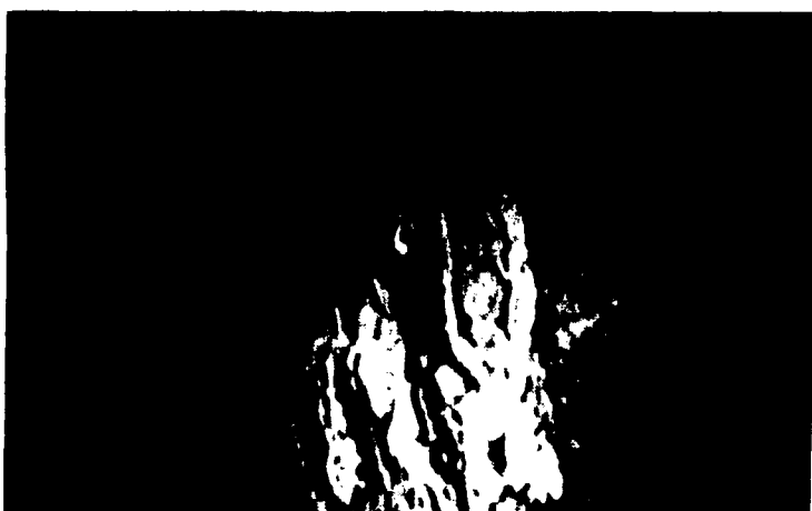
In this expedition you will also witness another first occurrence concerning the Titanic wreck. For the first time the main section of the wreck, the bow section, will be fully illuminated to be videotaped and photographed. To date, only small sections of the wreck have been illuminated with low-powered lights as you can see in the photo above of Titanic's hull taken from the "Nautilus." You will be there to witness for the first time as high-powered lights illuminate the entire bow section which is an area the size of a football field. It is a sight no one has actually ever seen. To date, artists have had to sketch the wreck like a jigsaw puzzle from partially illuminated sections of photographs and videos.

and accommodating cruise ships on the sea.