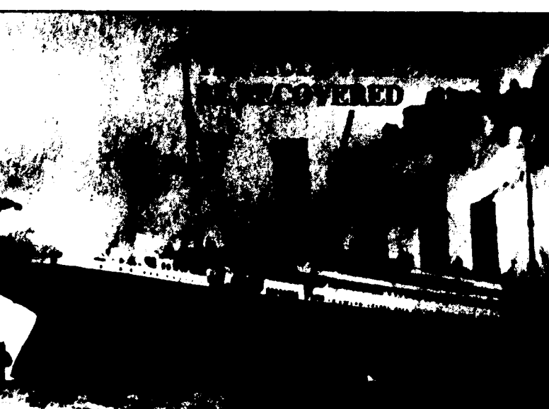
Pictured above is the RMS Titanic as she left for her maiden voyage. The section of Titanic that will be raised (outlined above) in this expedition is spectacular and pristine. It is 2-1/2 stories by 3 stories in size and weighs 25 tons! This section is a recognizable and definitive part of Titanic. It is from the very top of the hull. It houses six portholes and still carries the paint of the Titanic as it changes from the upper white stripe to the lower black color. Even the White Star Line trademark gold pinstripe appears intact. To date, the only artifacts recovered from the Titanic wreck were items brought on board by passengers, decor items and various utility items.

These special editions will be limited to only the attendees of these events. Therefore, with so few produced and the unique-