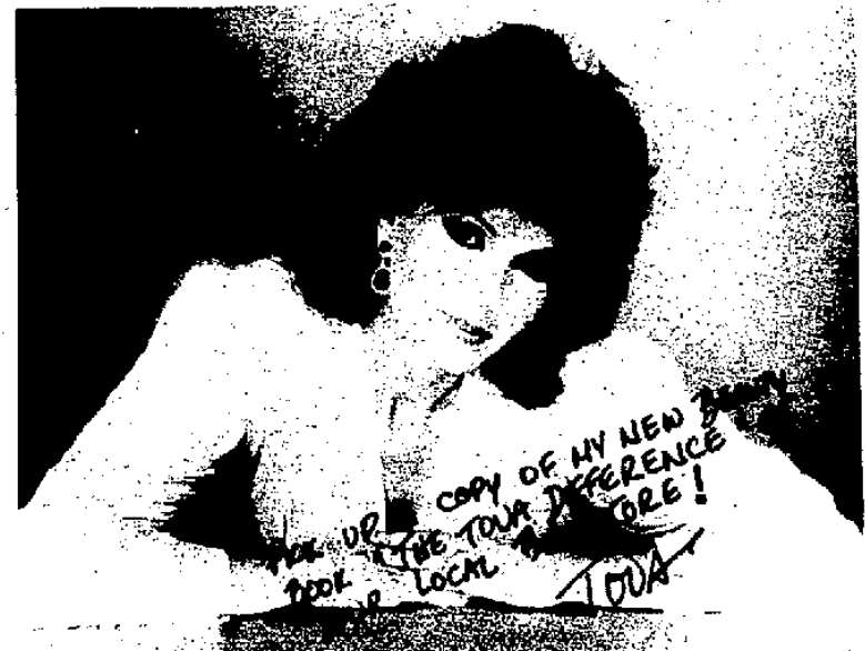
"I'm so positive my formula will take years off your appearance, that I'll not only send you a refund if you're non 100% satisfied, but I'll send you a free $21.00 gift immediately just for trying it.

Would you like to try this remarkable discovery? Would you like to have the beauty of youth without the scars and expense of surgery? If so, here's how you can try this amazing formula without any risk at ail: Simply go ahead and order Mrs. Borgaine's formula by mail or telephone. Then, as soon as it arrives, try it out in the privacy of your home, and take a close look at the amazing change you